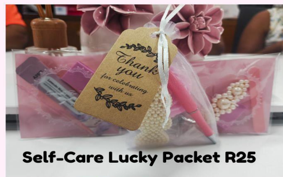
Self-Care Lucky Packet R25

Sales open on Karri: 4 May until 7 May 2026