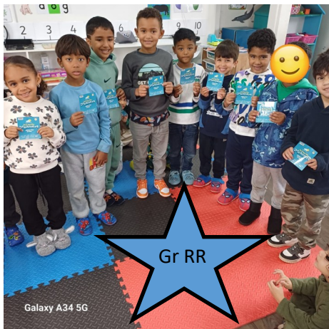
Galaxy A34 5G