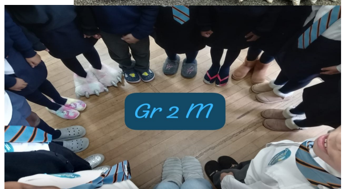
Gr 2 M