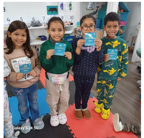
Galaxy A34 5G

SLIPPER DAY SLIPPER DAY SLIPPER DAY SLIPPER DAY SLIPPER DAY SLIPPER DAY SLIPPER DAY SLIPPER DAY SLIPPER DAY SLIPPER DAY SLIPPER DAY