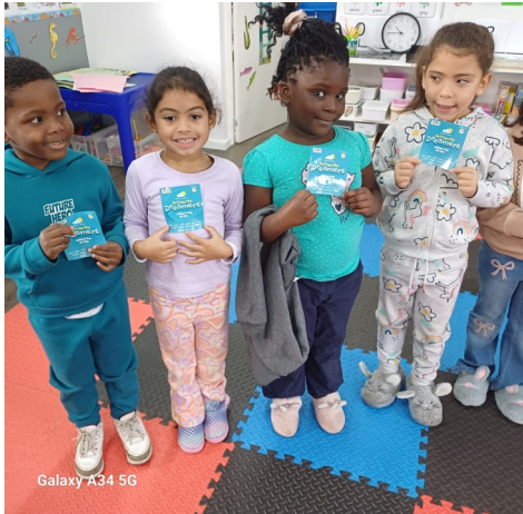
Galaxy A34 5G